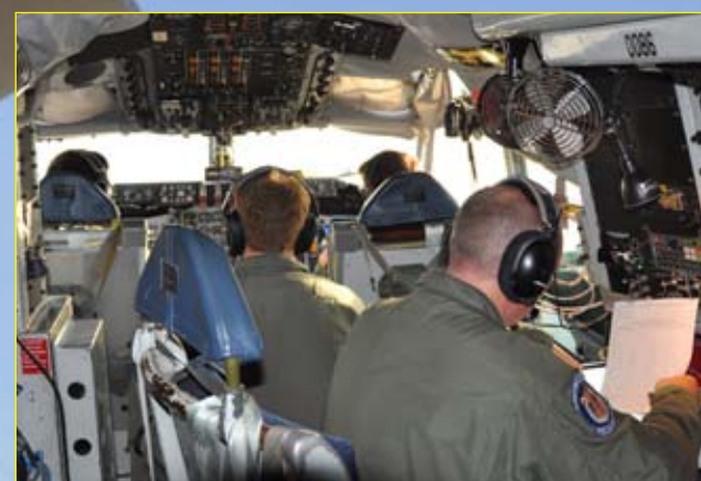
Crewmembers from the 63rd and 91st Air Refueling Squadrons make final preparations before departing MacDill Air Force Base for Royal Air Force Mildenhall, England, April 14. The Reserve and active duty crew flew to England and brought home a group of reservists who completed their annual tour requirement overseas.