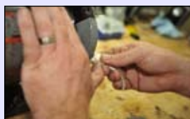
News/Features: page 12 Silver is airman's passion