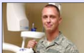
Diamond sharp: page 8 This week's standout