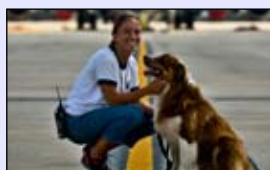
News/Features: page 10 BASHing aircraft threats