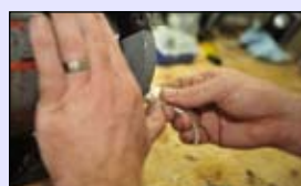
News/Features: page 12 Silver is airman's passion