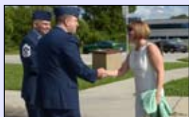
Community: page 17 Events, Chapel, more...