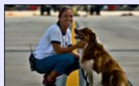
News/Features: page 10 BASHing aircraft threats