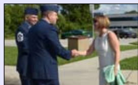
Community: page 17 Events, Chapel, more...