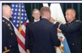
Week in photos: page 4 Scenes from MacDill