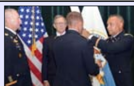
Week in photos: page 4 Scenes from MacDill